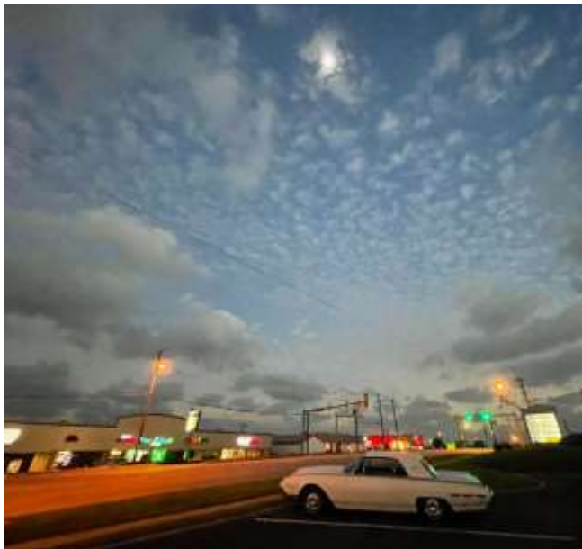
Above: Viewing the 2024 Solar Eclipse in style!