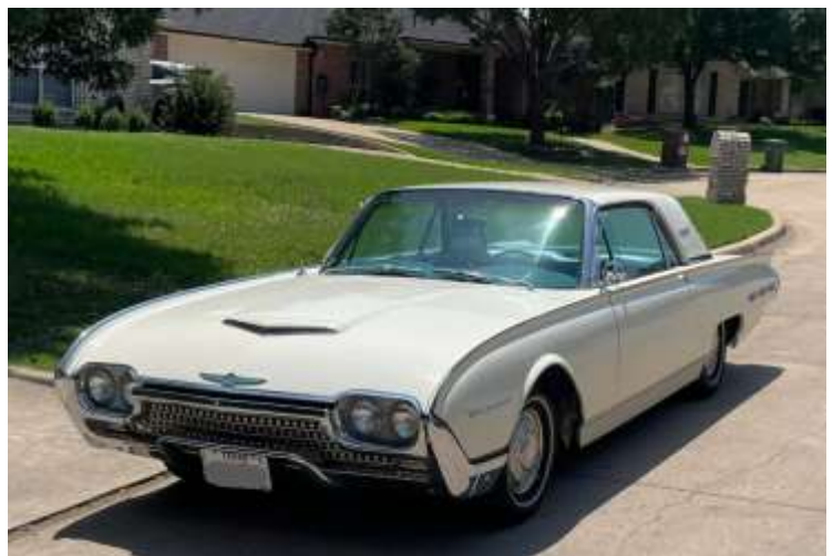
Above: Nothing improves curb appeal like a '62 Bird!